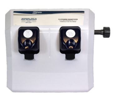
2-Button system Dispenses two products 125002