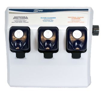
3-Button system Dispenses three products 125003