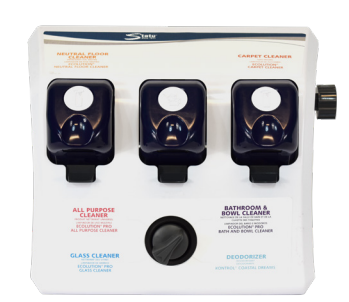
4+2-Button system Dispenses up to six products 125004